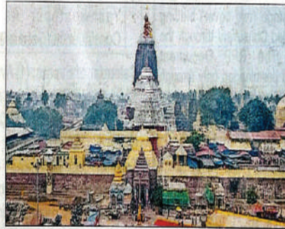
Earthen containers, flowers and attires used for the deities of Jagannath Temple will be on display

The exhibition will display items like kudua (earthen containers to carry Mahaprasad), flowers, bhogs and attires among others used for the deities in the temple. Three small chariots would also be displayed for visitors. According to the plan,