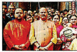
Governor Ragubar Das at the Jagannath Temple on Sunday

Police said special focus was laid on helping senior citizens and specially-abled pil-